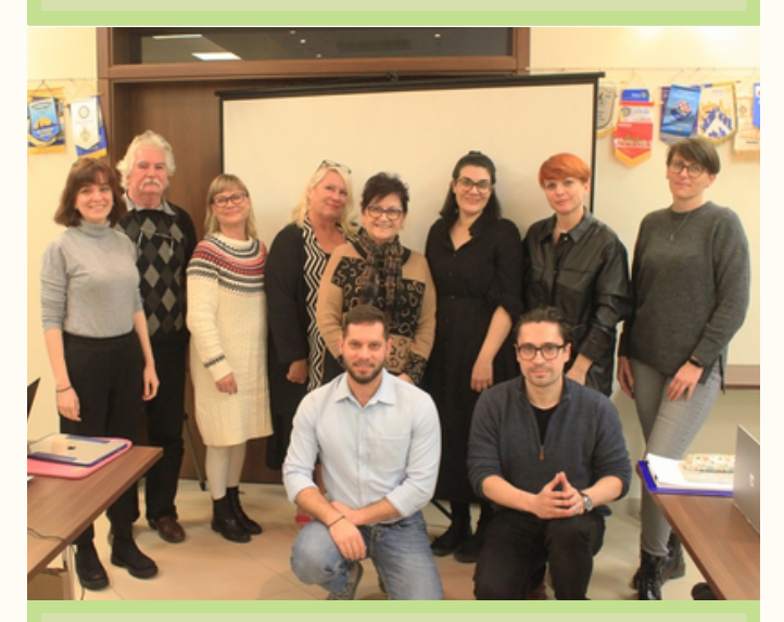
KICK-OFF MEETING: 16-19th January, 2023 (Hódmezővásárhely, Hungary)

https://tudasalapitvany.hu/gb/ecoffee-2/ https://www.facebook.com/ecoffeeconsumers https://www.instagram.com/ecoffee_erasmus/